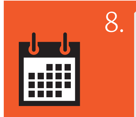
How long have you been in business? How big is your team? Crescendo has

Unfortunately, "nepotism" and backdoor deals are common in our industry. Not at Crescendo. Our relationships with builders/designers are purely professional – and based solely on the superior quality of our work. No kickbacks here.