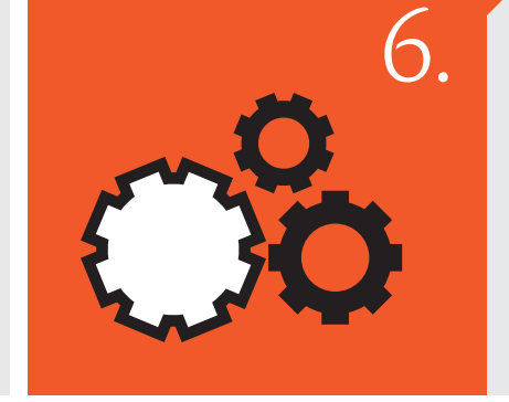
Is the system engineered to work as proposed? Or will they need to take the time to figure out what you really need? At Crescendo, we do our homework upfront so we know from the very start what you really need and how best to design and execute it flawlessly.