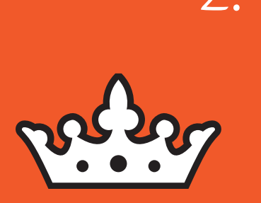
Are your products brand name, top-ofthe-line – or knock-offs? Crescendo works exclusively with the highest quality brand name products. No lower-tier products with high dealer margins here.